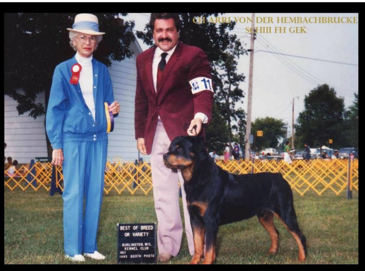
CHARL VON DER HEMBACHBRUCKE SCHIII FH GEK